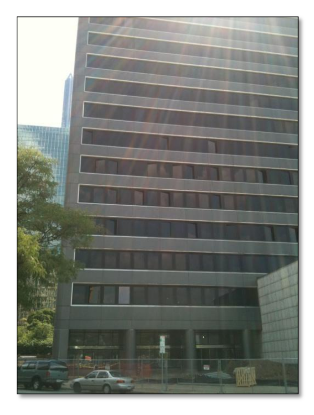
Figure 2: Exterior View of River Vue Apartments

River Vue Apartments, located in Pittsburgh, Pennsylvania, is a renovation project to convert the Old State Office Building into downtown apartment living. During the summer of 2011 the building's interior will be completely stripped to allow for new mechanical, electrical, fire protection and other systems to be installed in following months, with an expected substantial completion date in the spring of 2012. It has repetitive residential units on all floors,