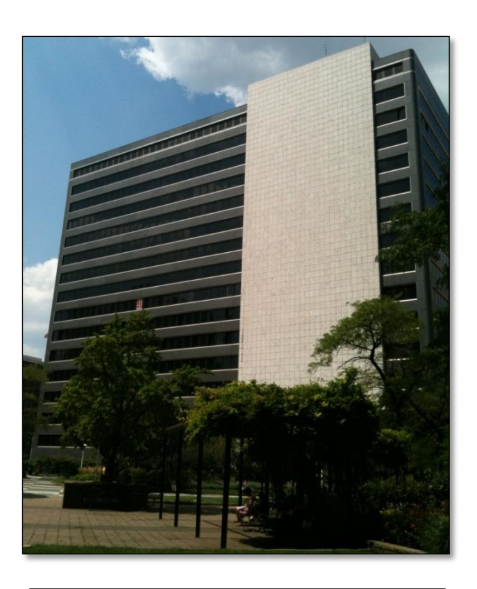
Figure 1: Exterior Photo of River Vue Apartments