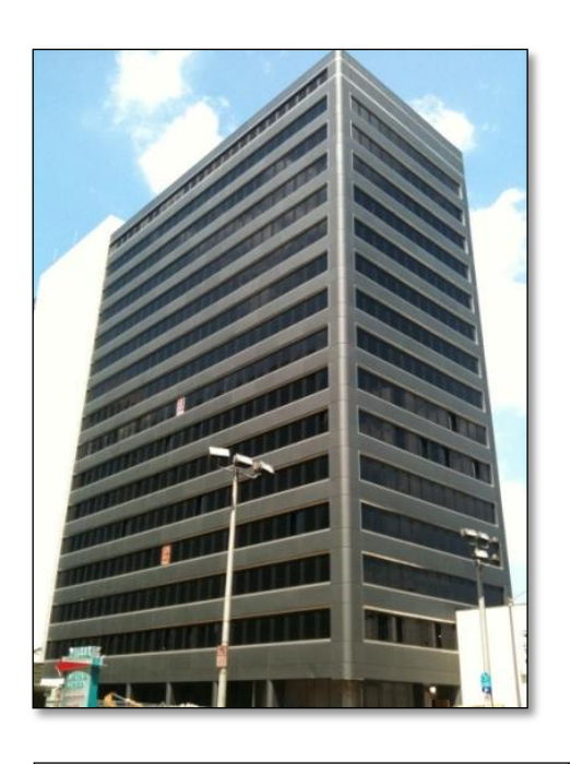
Figure 6: Exterior View of River Vue Apartments